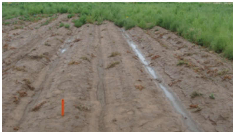
May 27, 2015 – 40 days after application of Scorch at 1.0 pint/A. Lubbock, TX – mixed population of kochia and Russian thistle in background.